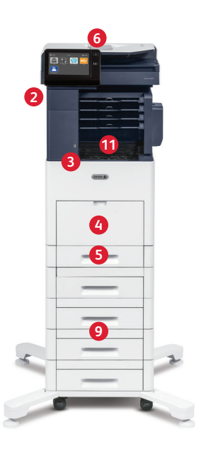
Xerox® VersaLink® B610 Printer