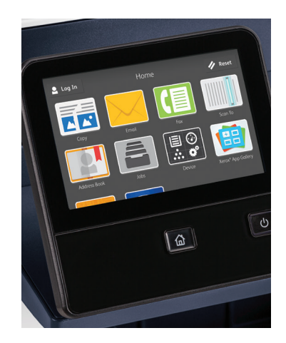
View a demo of our VersaLink device touchscreen at www.xerox.com/ VersaLinkUIDemo.

This unmatched balance of hardware technology and software capability helps everyone who interacts with our VersaLink printers and multifunction printers get more work done, faster.